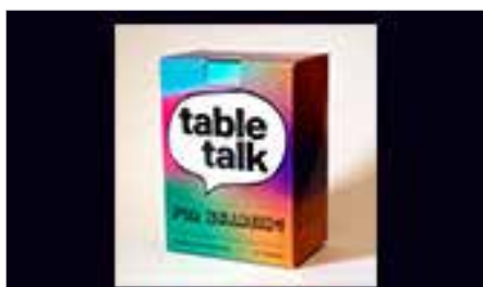
Table Talk for Wellbeing

In December we launched a new area of our website dedicated to listening well. It features listening resources, perspectives on areas of our shared life where there may be pain and disagreement, as well as insights into missional listening. Click here for the listening area. It is a work in progress, so if you have found a particular resource helpful as you have journeyed with others to enable listening, please do share it with us at faithandsociety@baptist.org.uk