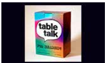
Table Talk for Wellbeing

Following the successful publication of 'A Flexible Framework for Local Unity in Mission', this new Toolkit provides an easy-to use framework to help local churches to collaborate with confidence and flexibility, developing the right agreement for their joint venture. The Toolkit guides readers step by step, explaining a variety of different agreements you could use, and helping you decide which will work best for your group. The Toolkit was produced by the Baptist, Methodist, Church of England and United Reformed Church National Ecumenical Officers, working with a group of volunteer County Ecumenical Officers, and can be accessed via the Churches Together in England website .