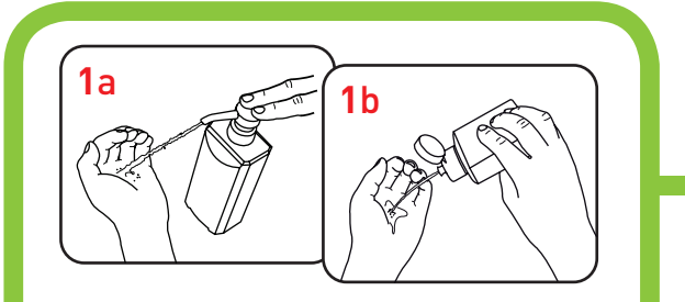
Apply a small amount (about 3ml) of the product in a cupped hand, covering all surfaces