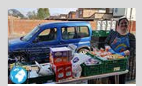
Millfield Community Fridge - 'It has been a faith stretching decision'