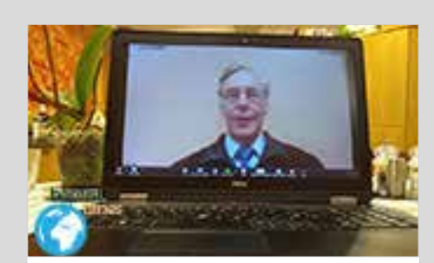
'It's NOT virtual church - the people are real' - Haggate Baptist Church online