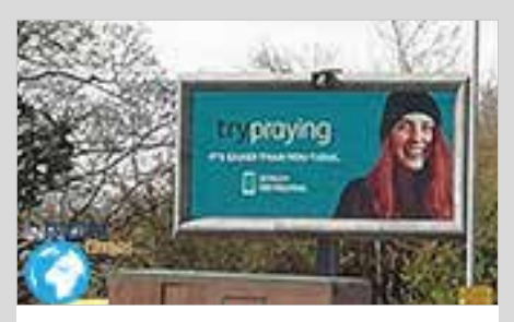
Churches around Cambridge encourage community to 'try praying'