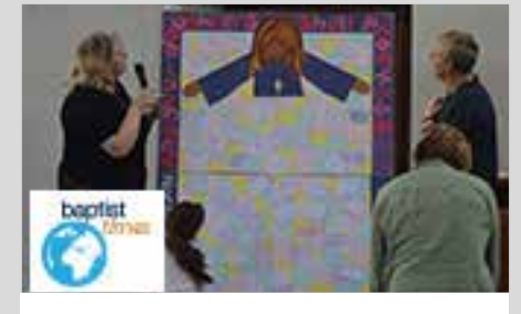
Celebrating 100 years of ordaining women to Baptist ministry - by Clive Burnard