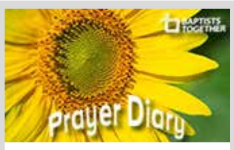
The July/August Prayer Diary is now available to download Please print out a copy for those unable to access it