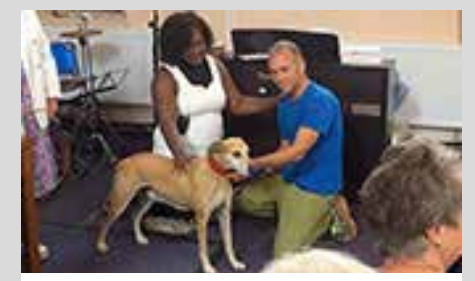
Read about Stapleton Baptist Church blessing dogs and their owners, in the West of England Baptist Association