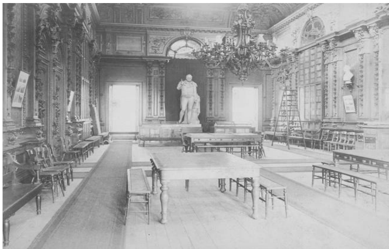
The Angus Library, London

John Bunyan was a key Baptist figure and as such we have many of his publications, including over forty versions of The Pilgrims Progress , starting with the eighth edition.