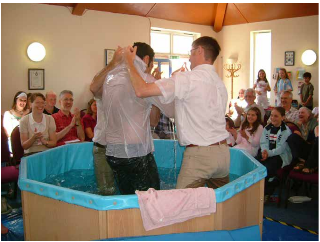
Photos from baptisms