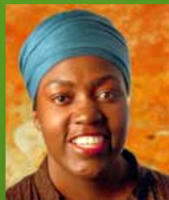
Affirming Women Leaders