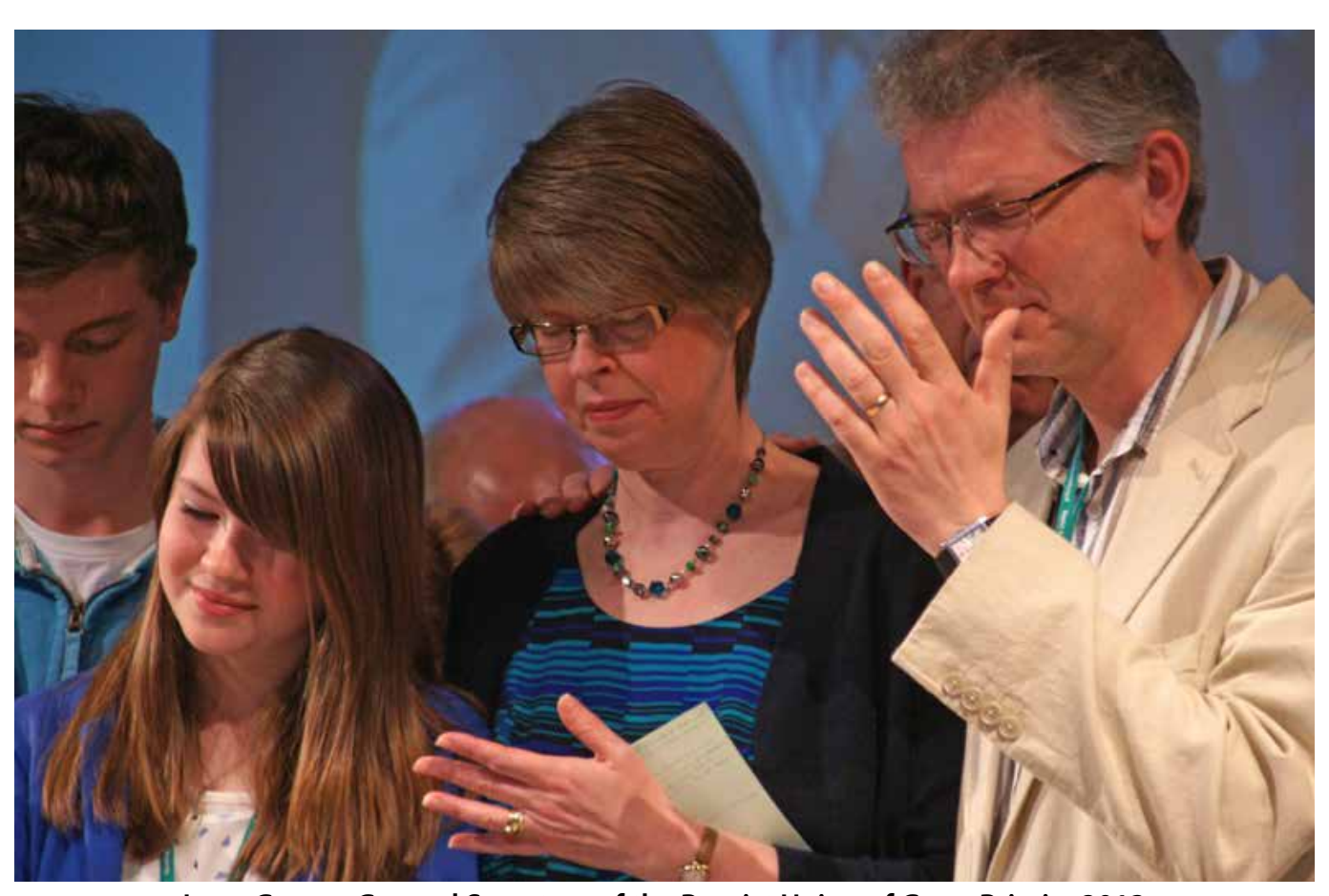
Lynn Green - General Secretary of the Baptist Union of Great Britain, 2013